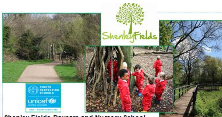
Shenley Fields Daycare and Nursery School Forest school trips to Ley Hill Park for all the family

In response to the feedback from parents we have planned more forest school sessions for this academic year. These sessions are for you and your children to join in with. The sessions will take place at Ley Hill Park with our forest school leaders.